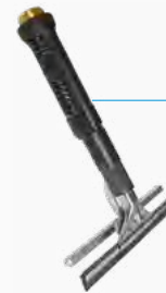
Lance with window cleaner & diffuser 250mm - 350mm - 450mm