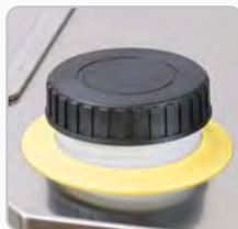
Detergent tank 14 liters