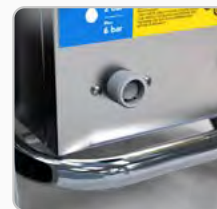
Water mains connection