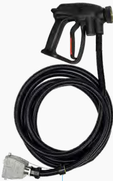
Steam hose 5m - 8m - 10m - 15m