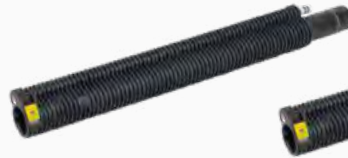
Extension tubes - 2pcs L. 480mm