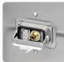
Steam outlet 10 bar - 12P