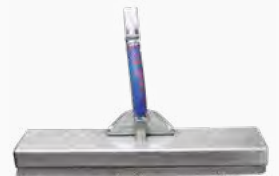
Steam brush with bristles 250mm - 350mm - 450mm to be connected to the Geyser lance