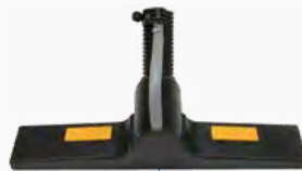
Floor tool L. 375mm