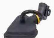
Steam+vacuum triangular brush *