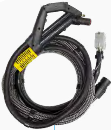
Steam/vacuum hose with control panel 4m - 8m - 12m