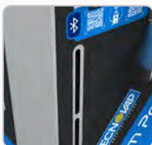
Water tank level indicator