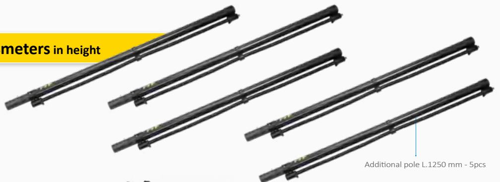
Additional pole L.1250 mm - 5pcs