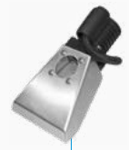
Stainless-steel upholstery tool