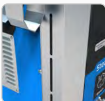
Detergent tank level indicator