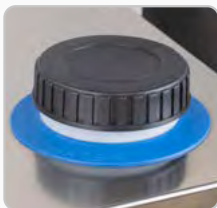
Water tank 14 liters