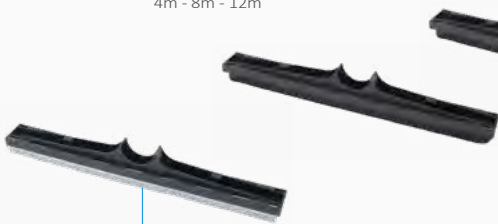
Squeegee/squeegee insert L. 375mm