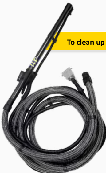
Initial pole L.950mm with control panel & steam/vacuum hose 6m or 8m