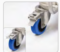
Anti-scratch rubber wheels 360° with safety brakes