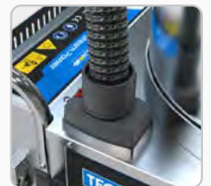
Female suction hose inlet