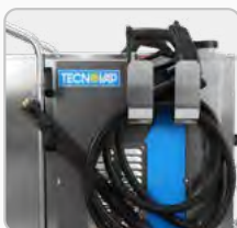
Hose holder and lance holder (accessories not included)