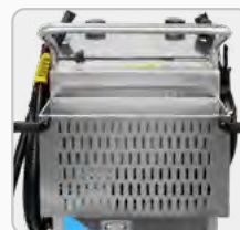
Accessory basket and cable holder