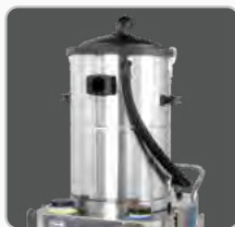
Vacuum cleaner with 43 liters vacuum drum and drainage hose