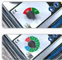
ON/OFF switch Power regulation switch