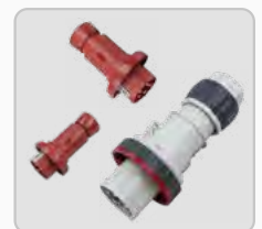
Electric plug with 8m cable: IEC309/16A Mod. 10,8 kW IEC309/32A Mod. 14,4 - 18 - 21,6 kW IEC309/63A Mod. 28,8 - 36 kW