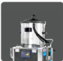
Vacuum cleaner with 14 liters vacuum drum and drainage hose